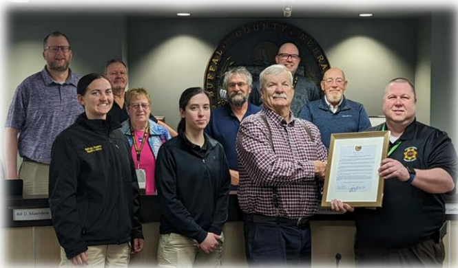
Buffalo County Board- NPSTW Proclamation