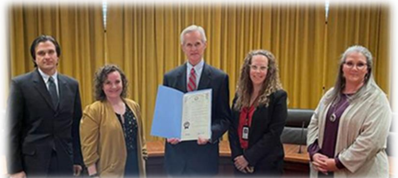
Governor's NPSTW Proclamation Signing

We saw lots of great social media posts. Here are just a few of the events and honorees we captured.