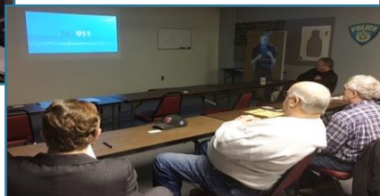
Columbus Police Dept.