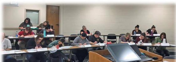
Basic Public Safety Telecommunicator Training Course NE Law Enforcement Training Center

The PSC state 911 department would expect to hold additional trainings in the coming year. Check-out training availabilities on the State 911 Training Information page of the PSC website .