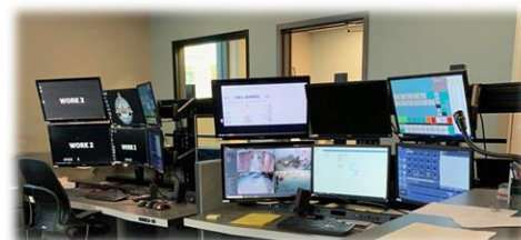
York Emergency Communications Center