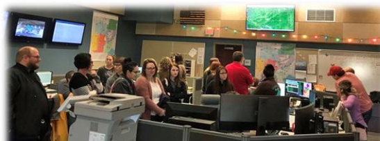
Class participants tour new Grand Island- Hall County Emergency Management & Communications Center