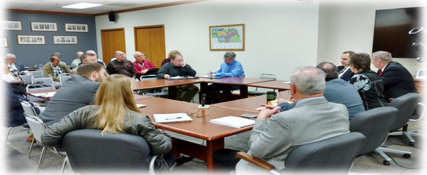
Participants provide comments during Workshop on GIS

In addition to the workshop, a comment period was provided allowing those unable to attend to submit their thoughts and information. The PSC will now evaluate and prioritize the information received as it looks toward the future of coordinating GIS data for 9-1-1 services in Nebraska.